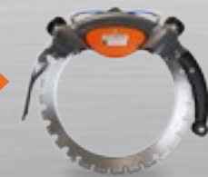
Adapter KOGIA 400