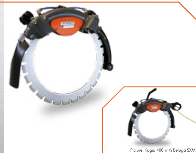
Picture: Kogia 400 with Beluga SXM