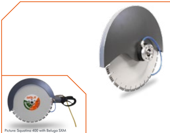
Picture: Squatina 400 with Beluga SXM