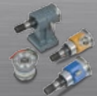
Drilladapter ARRA 600