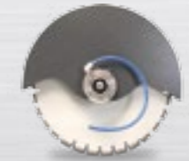
Adapter SQUATINA 400